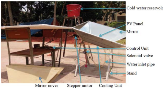
Fig. Solar Tracker with mirror booster

At first, the open circuit voltage and short circuit current is measured as a data of tracking with reflection system. After that the mirror is closed by a cover of opaque material and data is taken as only tracking system. Switching on the power supply, the solenoid valve would open and water is circulated through the cooling unit unless the outlet temperature of water drops down to 25°C. When the outlet temperature came down to 25°C microcontroller shut down the solenoid valve and data is taken as tracking with cooling system. Finally, the mirror cover was again removed and data is taken as tracking with reflection plus cooling.