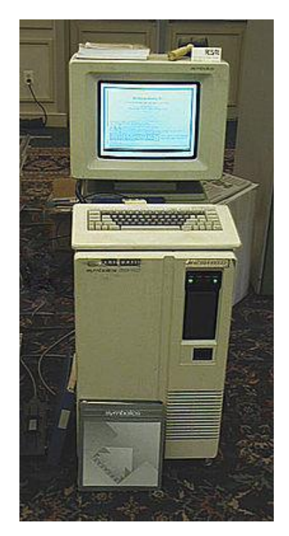
Fig. 2: A Symbolics Lisp Machine: an early platform for expert systems

In artificial intelligence, an expert system is a computer system that emulates the decision-making ability of a human expert. Expert systems are used to solve complex problems by reasoning through knowledge, represented mainly as if—then rules rather than through conventional procedural code.