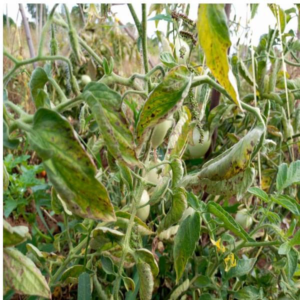
Figure 2: Bacterial leaf spottaken from Wanguru(Mwea)

A significant ( p < 0.05 ) variation in means of bacterial leaf spot occurred in all the tomato farms surveyed. Higher incidence was observed in farm 7 with mean of 16.000 % followed by farm 6 with mean of 14.667 %. the lowest incidence was recorded in farm 3 and 5 with mean incidence of 8.333 %. Five out of ten farms surveyed recorded means which were above general incidence mean of 11.828 % while the remaining farms had their means lower than the general mean (Table 2).