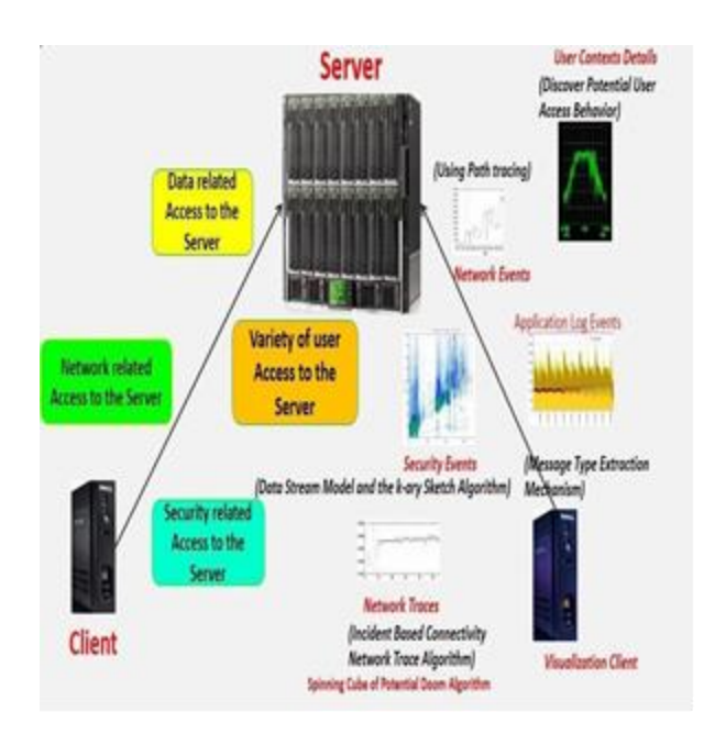
Figure 1 System Architecture

The Server level information process tends to define: