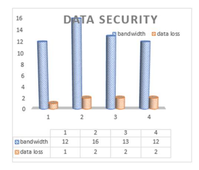
Chart 2: Data security

Not only does it desire to move data that has not been or is rarely accessed to a lower tier of storage than agreed for monetary reasons, but it may also attempt to hide a data loss incident due to management errors, Byzantine failures and so on.