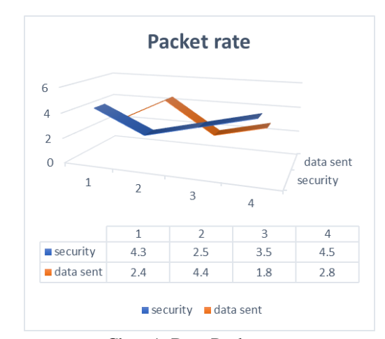
Chart 1: Data Packet rate

The system, which is proposed, now computerizes all the details that are maintained manually. Once the details are fed into the computer there is no need for various persons to deal with separate sections. Only a single person is enough to maintain all the reports. The security can also be given as per the requirement of the users. It also helps client to give timing task then could give the receipt also in print out format. Security threats faced by CLOUD data storage can come from two different sources. On the one hand, a CSP can be self-interested, untreated and possibly malicious.