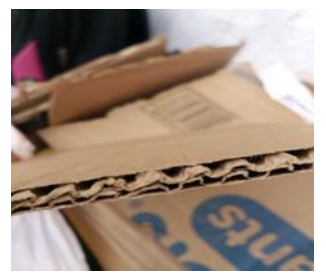
Fig. (1) Cardboard

aggregate by cardboard sludge to gain compressive strength of cubic specimen.