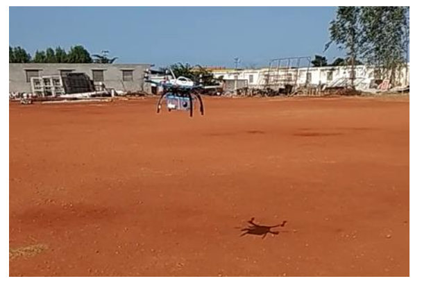
Fig 3: Final point of path (point 6)

The vehicle started from point 1 as shown in the map and traversed the path and reached the point 6. After reaching the point 6, it again changed its direction and returned to the home point which is point 1. We choose a nose which sprays water at a rate of 5L/min. Since this is a pilot project, we chose the tank quantity as 1 litre. It is to be noted that this prototype should not be given altitude input above 4 ft. giving which can lose the contact with the ground station.