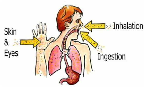
Fig: Possible ways for pesticides to enter the body

Use of UAVs can help in reducing these deaths and other health problems. [3] An unmanned aerial vehicle (UAV) has a wide range of applications in fields of agriculture, forestry etc. [4] for observing, transporting loads and sensing. [5] UAVs are operated remotely either by telemetry or other protocols, [6] where the operator maintains visual contact with the aircraft along pre-determined paths using GPS and other guiding sensors like compass. A commercial UAV was used to spray crops and the work rate and spray deposition measured for a number of spray techniques and spray volume application rates. [7] Recent works in the field of UAVs has addressed the requirement for low volume application, in consideration of limited payload capacity, has been emphasized. [8]