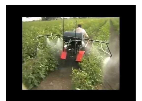
Fig: Farmer using Bullet Santi to spray fertilizers in the field

In 1994, Mansukhbhai Ambabhai Jagani, developed an attachment for a motorbike to get a multi-purpose tool bar. It addresses the twin problems of farmers in Saurashtra namely paucity of labours and shortage of bullocks. This motor cycle driven plough (Bullet Santi) can be used to carry out various farming operations like furrow opening, sowing, interculturing and spraying operations. This is more efficient and cost-effective for small-sized farms. [10] But there disad vantage of this method is that the labour can be exposed to the harmful effects of fertilizers either directly or indirectly if proper precautions were not taken.