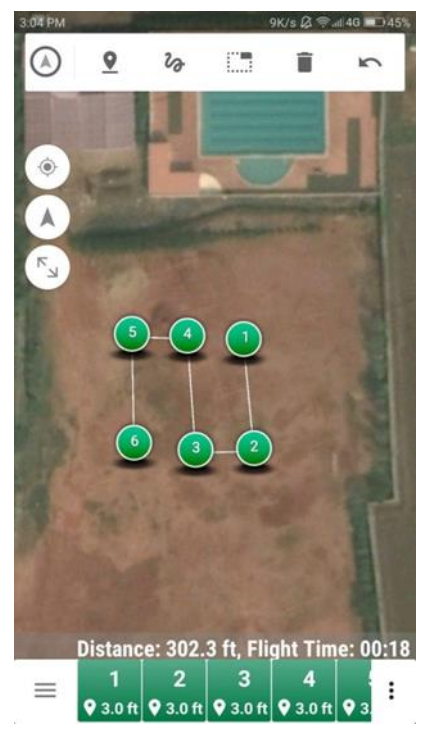
Fig 1: Creating waypoints on mission maker application