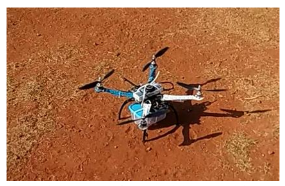
Fig 1: Image of proposed drone model

while spraying to check whether the targeted crops receive the required amount of fertilizers. We have used the motor as brushless motor, because they can achieve high torque. The aircraft must have an adequate payload capability as well as stabilization and localization capability. The movement of the quadcopter is controlled via 4 motors. The motor on the backward should rotate in a higher RPM than the front motors so that the quadcopter can move in forward direction. This way the movement of the quadcopter is controlled. In case if the quadcopter loses its connection with the ground station, we can operate the drone manually using the receiver.