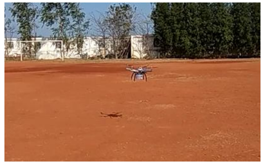
Fig 2: Take off point of drone (point 1)