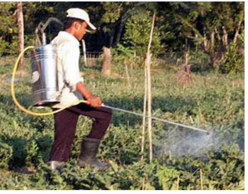
Fig: Man spraying fertilizers using a backpack sprayer

This consists of a tank, a pump, a lance (for single nozzles) or boom (for multiple nozzles). The tanks contain a mixture of water (or another liquid chemical carrier, such as fertilizer) and chemical which will be sprayed in the form of droplets. The size of droplets can be as large as rain-type drops or as small as almostinvisible particles. This conversion is accomplished by forcing the water and chemical mixture through a spray nozzle under applied pressure. The size of droplets can be altered by using different kinds of nozzles, or by altering the applied pressure, or a combination of both. Large droplets have the advantage of being less susceptible to spray drift, but they require more water per unit of land covered. Small droplets are most likely to make maximize contact with a target organism due to static electricity, but still wind conditions are required. But, in this type of spraying, the labour has to carry the complete weight of the pesticides tank which causes severe back pain and other physical problems to labour and hence this method reduces the human capacity. [9]