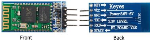
Fig 3: HC-06 Bluetooth

The HC06 bluetooth also has 4 pins which are TX, RX, GND and VCC. GND is ground whereas VCC pin is connected to 3.3V and TX, RX are connected to transmitting and receiving pins.