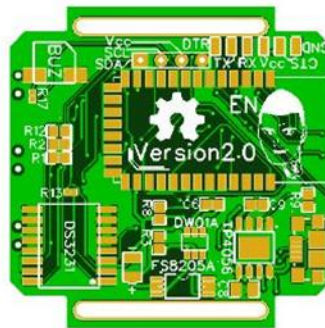
Fig 2: Front side of Smartwatch PCB