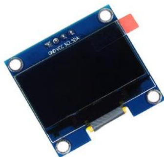
Fig 4: OLED Display

OLED screen is used to display all the necessary information which will be visible to the user. The OLED displays has 4 pins namely GND, VCC, SCL, SDA. SCL and SDA are used of transmission and receiving and GND is ground pin whereas VCC is connected to a 3.3V supply. The OLED screen used here is 128x64 SSD_1360.