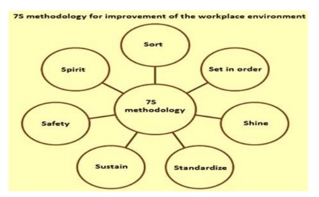
Fig. 2. 7S methodology for improvement of the work place environment

'Seven S' (7S) methodology is adopted in some of the organizations for the improvement of the workplace environment (Fig 2). This is carried out by eliminating or reducing the waste, inconsistency, and physical strain. The implementation of 7S methodology consists of seven phases namely (i) sort, (ii) set in order, (iii) shine, (iv) standardize, (v) sustain or selfdiscipline, (vi) safety, and (vii) spirit or team spirit. Each phase of 7S methodology continuously improves the performance of the organization by eliminating wastages of searching, waiting, transportation, motion, and work in progress inventory etc. The 7S methodology makes the working environment clean and safe which improves the morale of the employees and hence has a positive effect on their performance. The improvement is in the quantitative form as well as in the qualitative form. The quantifiable variables are searching, movement, and waiting time, cycle time, lead time, production rate, productivity, and quality etc. while the qualitative variables are working environment, communication, and morale etc.