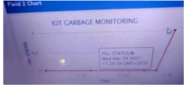
Fig.5. Graph shows that the dustbin is empty