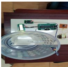
Fig.4. Hardware Snapshot of the Smart dustbin