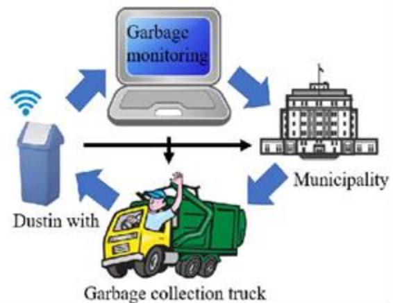
Fig.1. Model of the Smart Garbage Dustbin Management System Using IOT

from the mains supply is step down by the transformer to 12V and is fed to a rectifier. The output obtained from the rectifier may be a pulsating dc voltage. So as to urge a pure dc voltage, the output voltage from the rectifier is given to a filter to get rid of any ac components present even after rectification. Now, this voltage is given to a transformer to get a pure constant dc voltage. IR sensor detects the extent of garbage within dustbin. Load cell gives information about the load of the rubbish within the dustbin. When the bin is full the load cell gives information to the microcontroller. AVR microcontroller will give information to the municipality department through IOT webpage using Wi-Fi IOT module. IOT module is interfaced to the AVR microcontroller through which the information is out there within the internet.