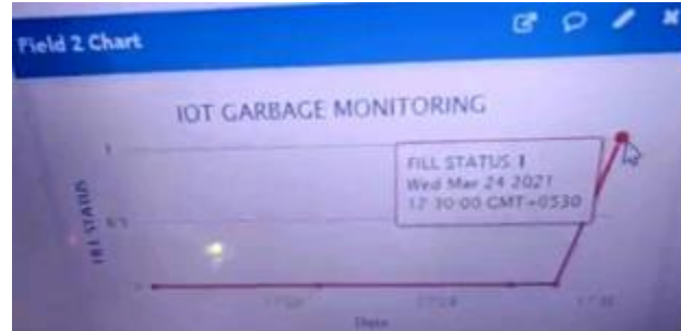
Fig.6. Graph shows that the dustbin has load