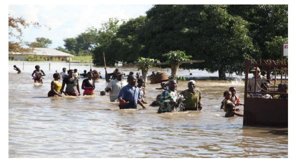
Figure 2 Picture of a submerged area of Asaba – Delta state Capital

Flood according to Macmillan English dictionary (2007), describe flood as a situation where water covers the dry land and water rises to its edge and covers the land around it. It is also a situation where there is a lot of more water than usual and may rise up over it onto the land and one of the causes of flood is raising sea levels and disruptions in weather pattern. Court (1990), states that whenever flood occurs, creates disastrous situations. Also, climate change causes flood, which is the scenario today and it is resulting fear in most river side communities because it's becoming difficult to predict locally. According to the Encyclopedia of Wkipedia (2009), a flood or deluge is an over flow of water that submerges the land and can be riverine, estuarine, coastal, and catastrophic or muddy in nature. Flood occurs under varied environmental situations. For instance, it is a fact that from time to time, an ocean can literally trespass its natural boundary hence submerging or flooding adjoining areas. Existence of marine features or deposits in continental ares is confirmation or a proof that such features must have been formed during transgression, but came to lime light after the ocean had regressed.