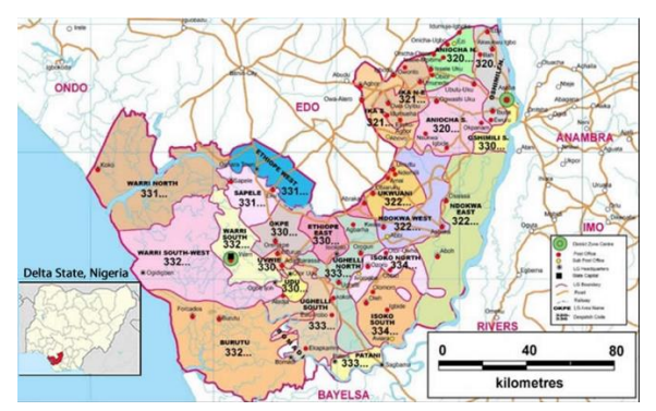
Figure 3. Demographic Map of Delta State