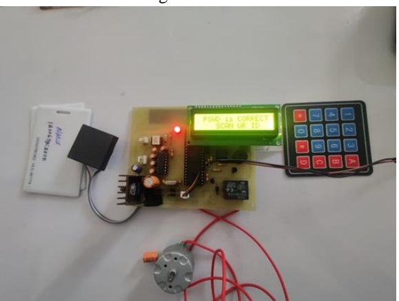
Fig mechanical arrangement