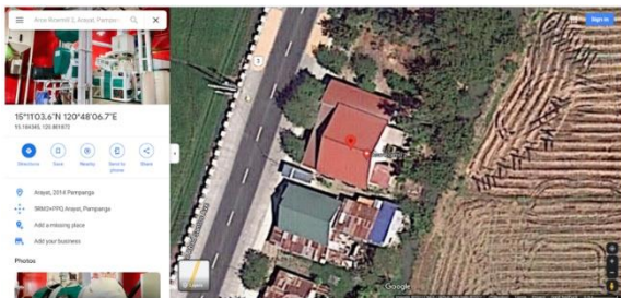
Fig. 1. Latitude and Longitude of Arce Rice Mill

Peak power is the greatest power that a power source can withstand for a brief period of time and is also known as peak surge power. Peak power is distinct from continuous power, which refers to the amount of electricity that the supplier can continually deliver. Table 3 shows that a normal average hour of sunshine is 5. The power supply is chosen based on the maximum total system power, which is estimated in Volts Amps Watts (TDK-Lambd, 2009).