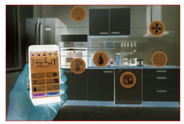
Figure 1: Smart kitchen using a smartphone

An app that is compatible with your smart kitchen appliances must be installed. With the help of the app, we can access our home appliances as per our needs from short as well as very long distances. Figure 1 reveals the various appliances controlled by an app or smartphone [8-12].