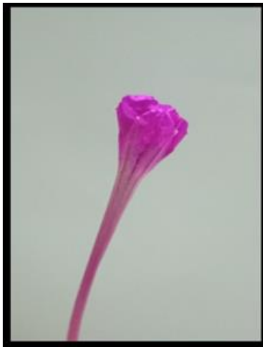
Figure 3-Flower blooming at 6.45 pm

The intensity of sunlight from 10 am in the morning to 5 pm in the evening was almost the same. There was no indication of the exact position of the Sun due to thick cloud. On that day, the flowers started blooming at 4 pm. The first flower started at 3.59 PM, as in figure -5.