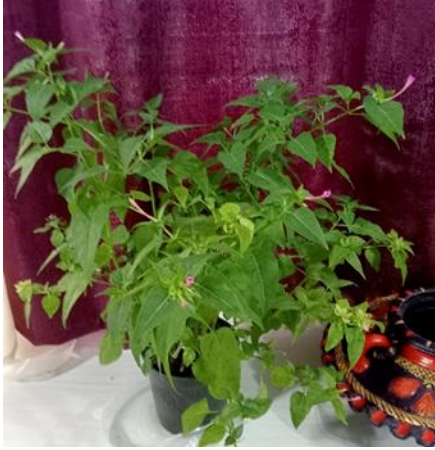
Figure 7 Plant kept inside the house.

I kept the whole pot plant inside the house. There was no sunlight even through windows as I had placed thick dark curtains. Again, first flower bloomed at 4pm. No change in overall phenomenon.