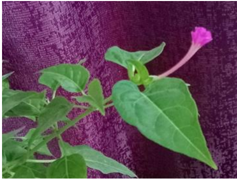
Figure 8 Blooming at about 4 pm.

I kept the whole pot plant inside the house. There was no sunlight even through windows as I had placed thick dark curtains. Again, first flower bloomed at 4pm. No change in overall phenomenon.