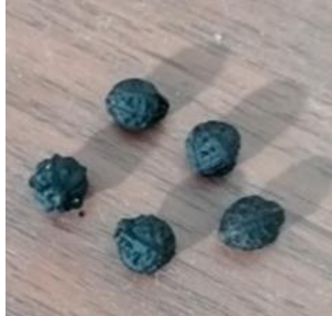
Figure 10 Seeds.

Seed formation rate was observed as about 80%.