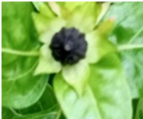
Figure 9. Seed formation.

Seed formation rate was observed as about 80%.