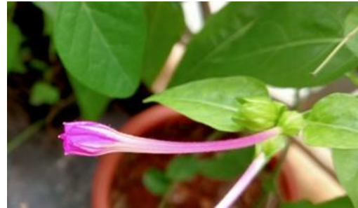
Figure 5 Started blooming.