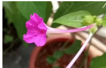
Figure 6 Flower at about 4.30 pm