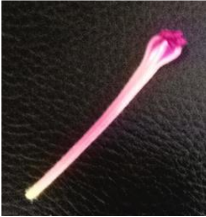
Figure 2 Flower bud separated from plant