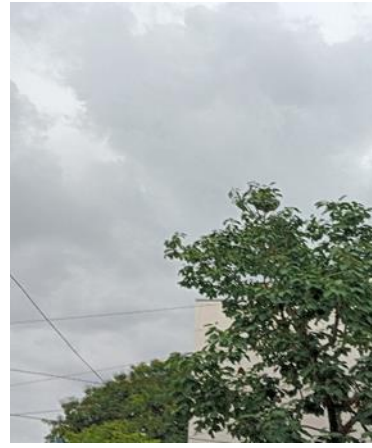
Figure 4 Cloudy day

It started blooming at 6.45pm. That means about 2 hours and 45 minutes delay compared to normal blooming time.