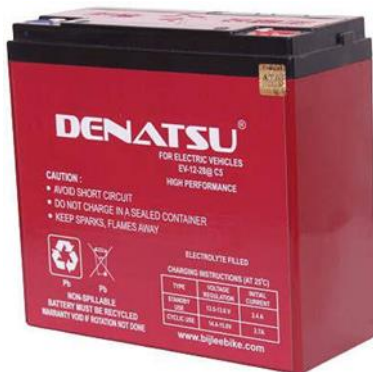
Fig 4: Lead Acid Battery

Lead Acid Battery gives High Performance and is maintenance free battery which helps in constant discharge. Size of batter is also compact so it will be easy to install in small Bicycles as well. We have made use of 9Ah * 3 Batteries in Series which will give output of 28 Ah Approximately. This Battery is connected to Current Controller of E-Bike (Cycle).