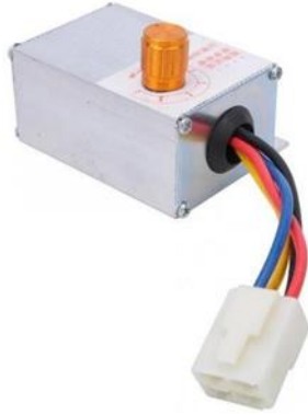
Fig 3: Current Controller

( https://robu.in/wp-content/uploads/2020/01/8-3.jpg )