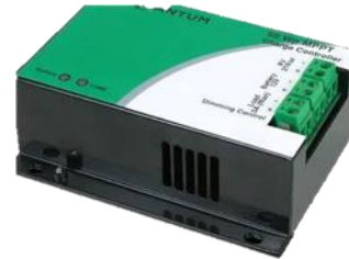
Fig 2: MPPT

more power to go into the battery or batteries. MPPT is required to monitor current and voltage from solar panel. MPPT tracks Changing operating point when the power is at its maximum and this will increase efficiency of Solar Cell. As MPPT is capable of such things that is why we have used MPPT over PWM also MPPT is Affordable. [3]