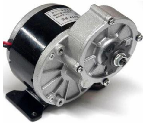
Fig 5: Geared DC Motor

speed of motor is more efficient in DC Gear Motor. It has gear assembly connected with motor. [5]