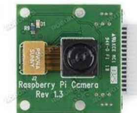
Figure 1: Raspberry Pi Camera

The smart eyewear design focuses on the central role played by the Raspberry Pi 2 as the processing unit, allowing for versatile functionality. By utilizing a Linux-based ARM processor, the eyewear system benefits from the robust capabilities of the Raspberry Pi platform. The inclusion of a micro SD card slot enables the expansion of task functions as needed, ensuring adaptability to the user's requirements. With the Raspberry Pi camera serving as the primary image acquisition tool, it captures real-time visuals that are crucial for various applications. This camera is seamlessly connected to the Raspberry Pi using a flexible cable, providing reliable data transfer and synchronization. Placing the camera on the top middle of the glasses ensures optimal image capturing by aligning it with the user's line of sight, facilitating accurate representation of the user's visual field. Furthermore, the Raspberry Pi's audio port enables the integration of an earpiece, enabling the user to receive auditory feedback and interact with the smart glasses discreetly. By configuring the Raspberry Pi GPIO port to receive input from push button switches, users can easily initiate different functions and tasks with a simple press, enhancing usability and control. Finally, the inclusion of a custom-designed frame with red borders aids in text identification, making it easier for the smart glasses to locate and process text from reading materials.