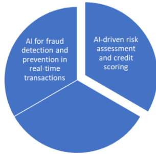
Figure 1: Artificial Intelligence in Real-Time Payment Systems

Machine learning (ML), a subset of AI, is particularly valuable in payment systems for its ability to learn patterns from historical transaction data and make predictions or classifications without explicit programming. Supervised learning models analyze labeled datasets to detect fraudulent transactions or classify payment risks, while unsupervised learning techniques identify hidden patterns or anomalies that might indicate suspicious behavior. Anomaly detection algorithms, often built upon clustering or outlier detection methods, scan real-time payment streams to flag unusual activities such as atypical transaction amounts, frequencies, or locations, which may signal fraud attempts or errors. Natural Language Processing (NLP) further enhances AI's capabilities by enabling automated understanding and generation of human language, which is critical in customer service chatbots, payment inquiries, and fraud alert notifications.