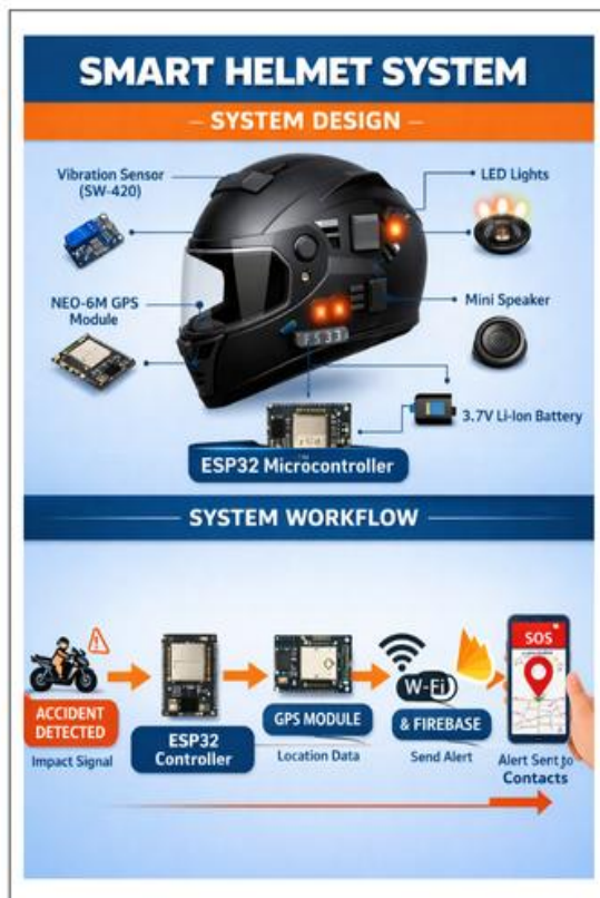
Fig 1. system design and workflow plan for developing smart helmet

response and improves the chances of timely medical assistance for accident victims.