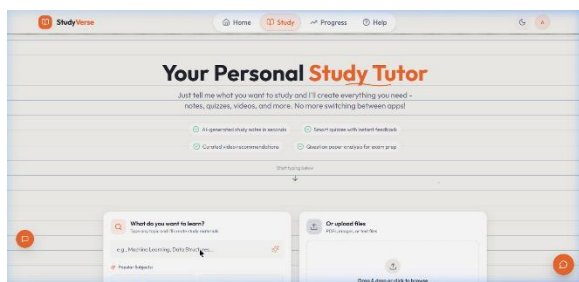
Figure 2: Study Interface for Topic Input and File Upload.

If a student has their own college notes in a PDF file, they can upload it directly. We used a library called Tesseract.js which reads the English text from the uploaded PDF or image. This extracted text is then passed to the AI to make a summary from the student's own material.