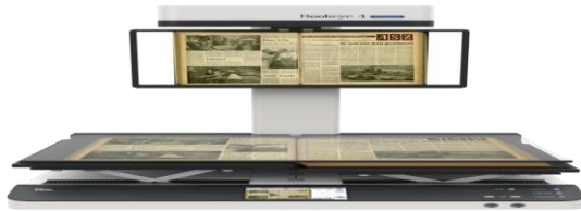
Figure 1 Book-eye 4 scanner