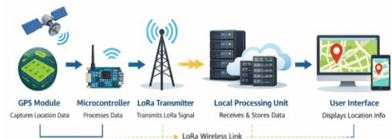
Fig. 2: Workflow of LoRa-Based Location Tracking System

The workflow begins with the GPS module capturing location data. The microcontroller processes this data and transmits it through the LoRa module. The LoRa gateway receives the data, processes it, and stores it locally. The processed information is then displayed on a local user interface.