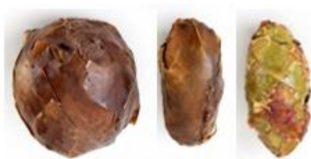
Fruits coated with Film

( Syzygium cumini ) showed reduced moisture loss, maintained better firmness, and retained their natural color. No visible fungal growth or surface spoilage was observed on the wrapped fruits. These findings indicate that the CMC–collagen bioactive film effectively preserved freshness and delayed spoilage during the storage period.