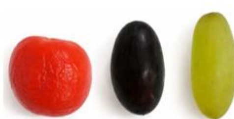
Post packaged Fruits