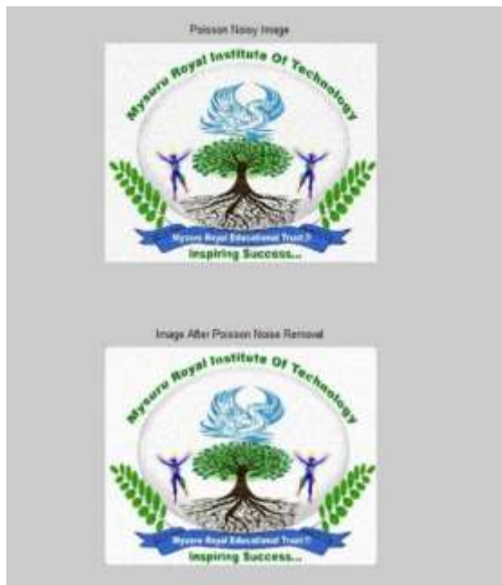
Figure 2: Performance of noise reduction on Poisson noisy image

The results also show that suitable filtering techniques can effectively reduce noise while preserving important image features such as edges and textures. The comparative analysis highlights the importance of selecting appropriate filters for achieving better image restoration and improved visual quality.