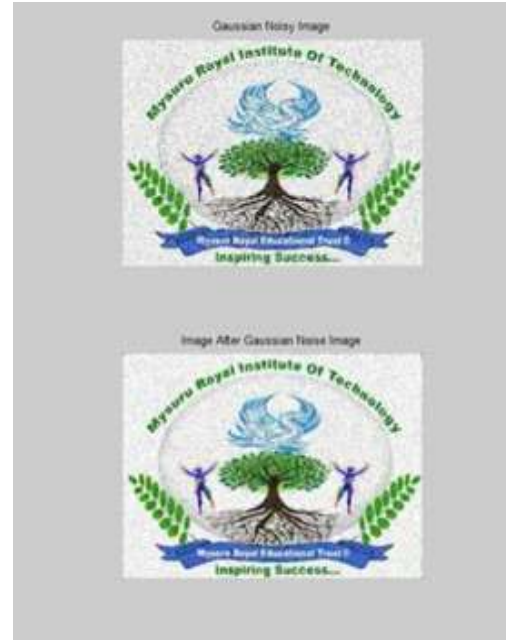
Figure 3: Performance of noise reduction on Gaussian noisy image