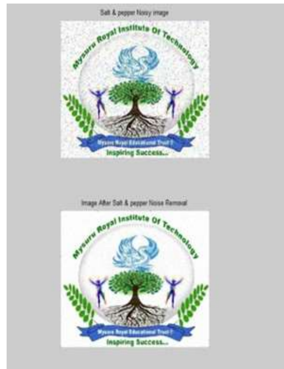
Figure 4: Performance of noise reduction on Salt and Pepper noisy image