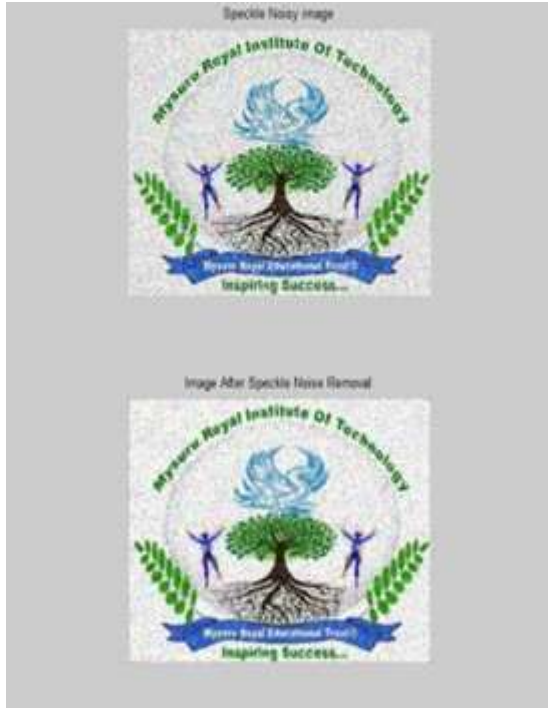
Figure 5: Performance of noise reduction on Speckle noisy image