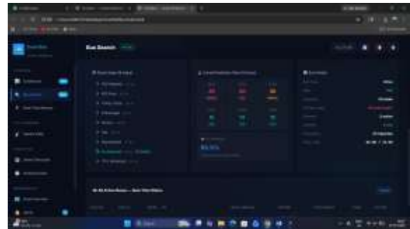
Figure 3: One can search for their own bus number and know it's live occupancy