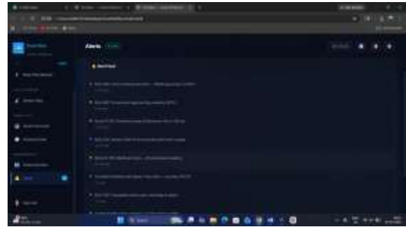
Figure 2: Gives alert about which bus is likely to be crowded