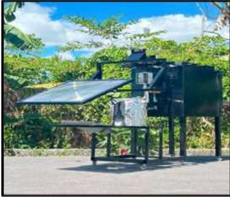
Figure 2. Actual prototype of the hybrid solar heat concentrator salted egg cooker

Prior to the performance evaluation of the Hybrid Solar Heat Concentrator Salted Egg Cooker, the salted eggs were prepared and arranged systematically to ensure proper sampling and accurate assessment of cooking quality. A total of sixty salted eggs were utilized during the testing procedure. Each egg was assigned a unique identification number from 1 to 60 and placed on two steaming trays arranged in a 6 \times 5 configuration per tray. The numbering system enabled the researchers to monitor the location of each egg throughout the steaming process and facilitated the selection of representative samples after cooking.