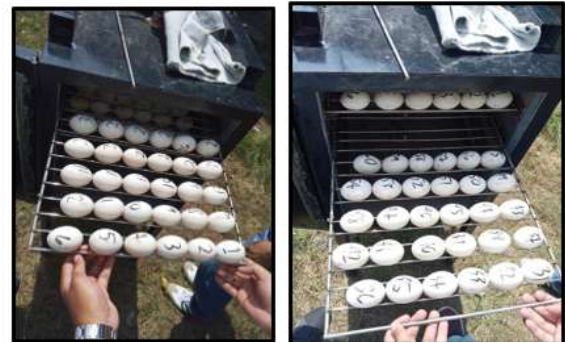
Fig. 3 Manual placement of salted eggs

Following the steaming operation, a stratified sampling method was employed to evaluate the cooking performance of the machine. The steaming trays were divided into strata according to egg location, representing the front, middle, rear, left, right, upper, and lower portions of the cooking chamber. Sample eggs were then selected proportionally from each stratum to ensure that all sections of the steamer were represented during quality assessment. This method allowed the researchers to determine whether steam distribution and heat transfer were uniform throughout the cooking chamber.