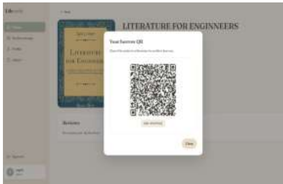
Figure 2: QR-Based borrow verification process