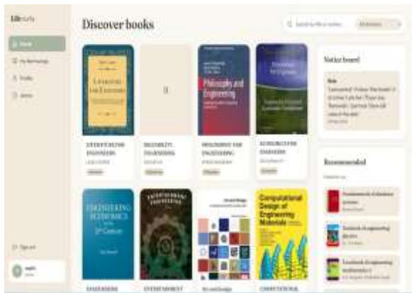
Figure 1: Student Home Interface

The Libraria Smart Library Management System was successfully developed and tested with all major functionalities operating effectively. Students were able to register, browse books, request borrowings, and access recommendations through both web and Android applications. The QR-based verification process successfully automated borrow approvals and reduced manual verification errors. Administrators could monitor borrow requests, track fines, and manage inventory efficiently through the admin dashboard. The Machine Learning recommendation engine generated personalized suggestions using TF-IDF and Cosine Similarity algorithms. The analytics module generated graphical reports and statistical insights related to borrowing trends, overdue risks, and fine analysis.